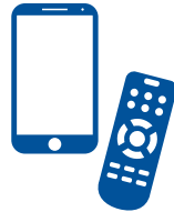
Cell phones and TV remotes