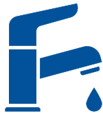
Taps and faucets