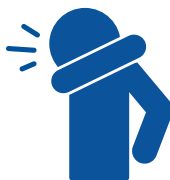
Sneeze or cough