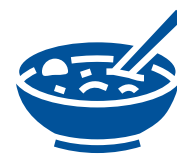
Eat or prepare food