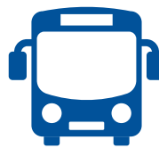
Take public transportation