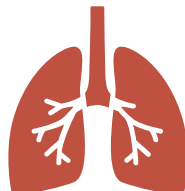
Shortness of Breath