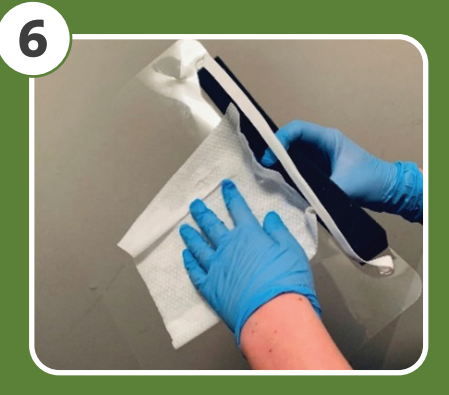
If face shield can be reused per "DUHS instructions for extended use or reuse" Hold the foam side of face shield away from face, using Oxivir TB wipe or other approved disinfectant start by wiping the inside of face shield and along the foam piece in a downward motion away from you.