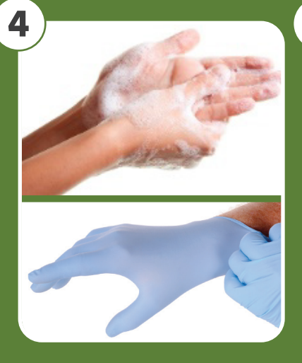
Perform hand hygiene and don gloves.