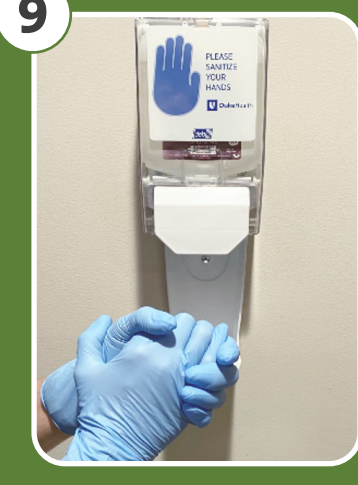
While gloves are still on, perform hand hygiene using hospital-approved hand sanitizer.