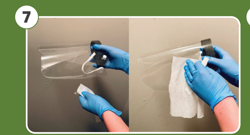
Next use the same wipe to clean the outer surface. Continue holding the foam piece and bend slightly to create a strong cleaning surface and wipe both sides in a downward motion away from you. Discard wipe. If face shield is cloudy once disinfectant dried, wipe with a damp paper towel and dry with fresh paper towel.