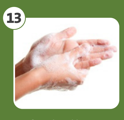
Perform hand hygiene. Exit anteroom.