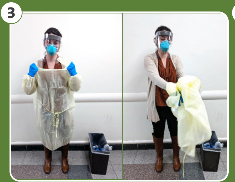
Remove gown and gloves, touching at the shoulder away from face. Roll inside out and dispose in designated receptacles/bags.