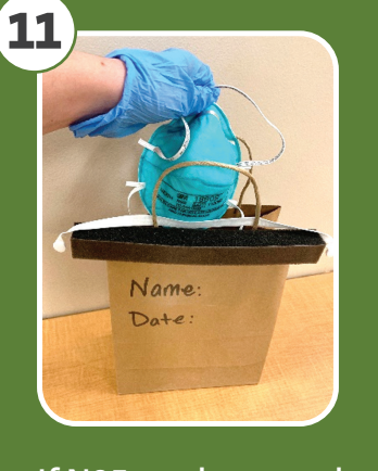
If N95 can be reused per "DUHS Guidelines for Extended Use and Reuse," place directly in labeled paper bag. Keep face shield on outside of the bag and store both together in a designated spot in anteroom or on unit.