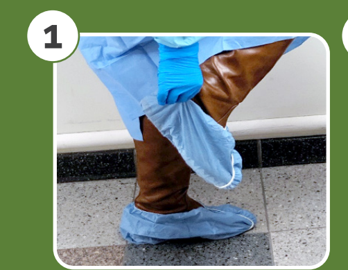
If shoe covers are part of your entity's protocol, please doff these while still in the patient room.