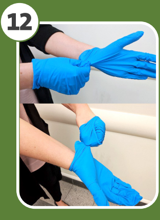
Remove gloves using proper pinching technique.