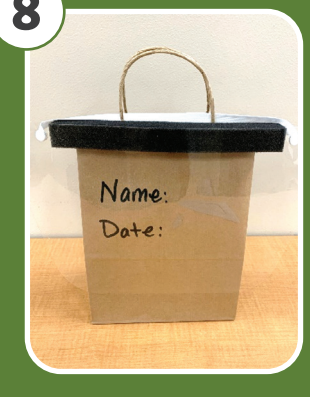
Using the handle of the paper bag, allow the face shield to dry by hanging on the strap of one side of the bag.