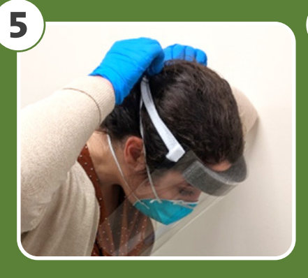
Slightly lean forward, remove face shield using two hands touching only the elastic band behind ears.