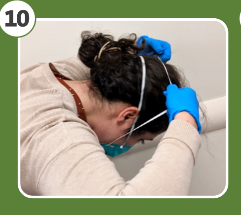
Remove N95 by handling bottom strap first and then the top strap behind ears.